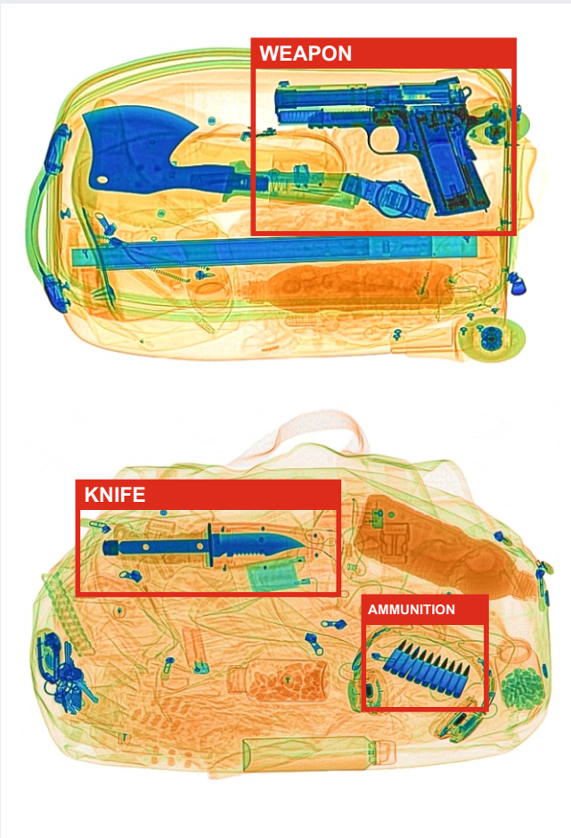
Examples of Images with Automatic Threat Detection by the AI Software System